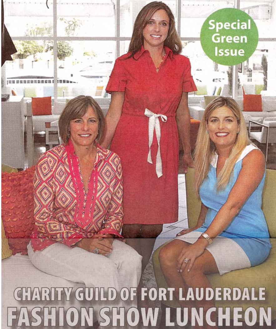
CHARITY GUILD OF FORT LAUDERDALE FASHION SHOW LUNCHEON