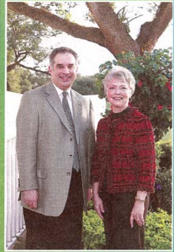
AMERICAN CANCER SOCIETY